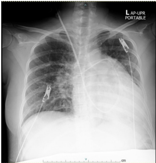
Fig. 1. Preoperative chest radiograph.

CI: cardiac index (L/min/m 2 ), CSE: combined spinal-epidural, CVP: central venous pressure (mmHg), DBP: diastolic blood pressure (mmHg), HR: heart rate (beats/min), PAP: pulmonary arterial pressure (mmHg), PCWP: pulmonary capillary wedge pressure (mmHg), SBP: systolic blood pressure (mmHg), SVR: systemic vascular resistance (dynes/s/cm -5 ), NA: not available. Time 1 = 5 min after combined spinal-epidural anesthesia administration. Time 2 = 20 min after combined spinal-epidural anesthesia administration. Time 3 = immediately after delivery. Time 4 = 15 min after delivery. *Parameter measurement by EV1000.