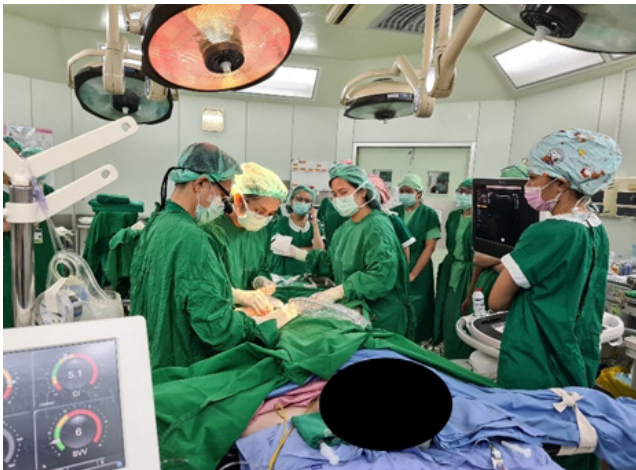
Fig. 2. A cardiac surgeon inserted an introducer sheath for ECMO to the right groin after spinal-epidural anesthesia was performed; before starting cesarean delivery. ECMO: extracorporeal membrane oxygenation.

patient then achieved an adequate anesthetic level to the 4th thoracic dermatome (T4). During surgery but before the fetal delivery, the PAP suddenly increased from 60/22 to 88/37 mmHg but with a stable systolic blood pressure. To reduce the PVR, milrinone (Primacor ® , Sanofi-Synthelabo Inc, USA) was initially given at 0.3 µg/kg/min, with incremental adjustments of 0.5 µg/kg/min to reduce PVR. The PAP subsequently dropped slightly to between 67–76/22–26 mmHg. The patient's cardiac monitoring parameters are listed in Table 1.